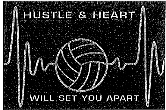
OPTION #2 IN BLACK

PLEASE FILL OUT THE ORDER FORM AND RETURN IT WITH PAYMENT TO THE HIGH SCHOOL OR ELEMENTARY SCHOOL OFFICE BY MONDAY, AUGUST 20TH AT 8AM. SHIRTS WILL BE DELIVERED BY WEDNESDAY, AUGUST 29TH.